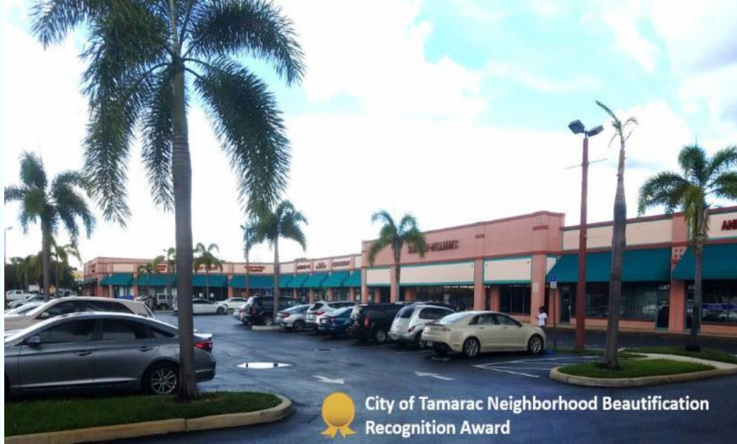
City of Tamarac Neighborhood Beautification Recognition Award