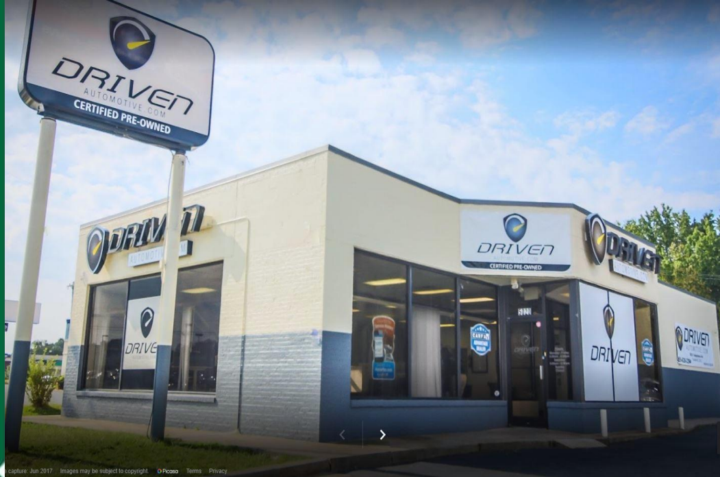
©capture Jun 2017. Images may be subject to copyright. ©Picoo Terms Privacy